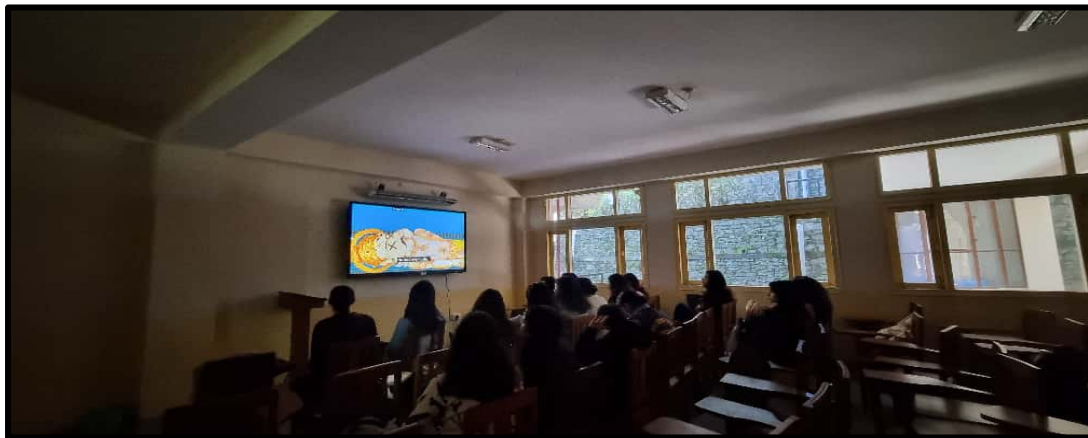
Book and Film Reviews Fridays

Outcome: The book and film review sessions with the students has yielded promising results in fostering critical thinking and analytical skills.