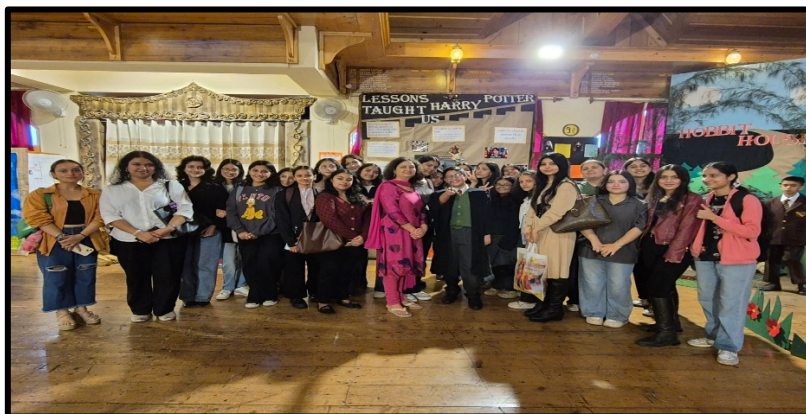
Students in the English Literature Exhibition at Auckland House School

Khushwant Singh Literature Festival 2025