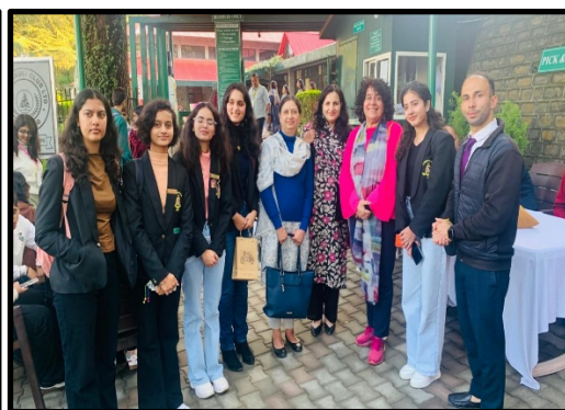
Students Attending Kushwant Singh Lit Fest at Kasauli