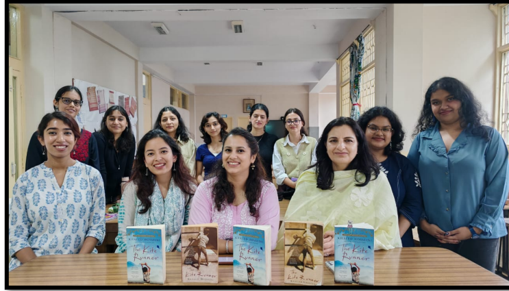
Kite Runner Discussed