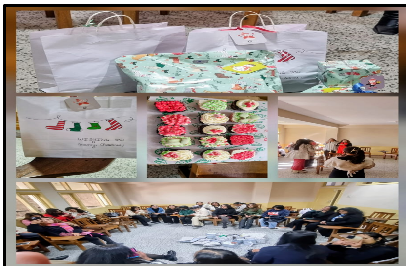
Students Exchanging Gifts

Students participated wholeheartedly in the celebration, gaining a deeper appreciation of the values of sharing and goodwill associated with Christmas, while also strengthening peer relationships.