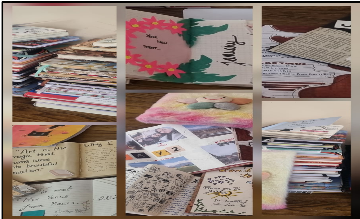
Dream Journals made by the students

The Dream Journal Project has proven to be a valuable and insightful initiative, significantly contributing to the comprehensive development of students by integrating creativity with meaningful self-reflection.